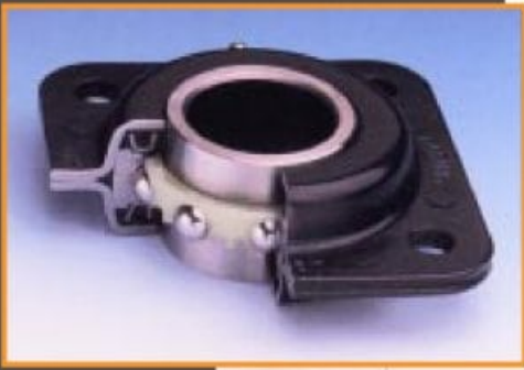
Timken® Fafnir® 491A disk harrow unit